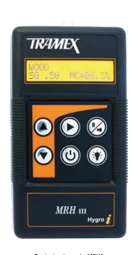
Product order code: MRH3

The Moisture and Relative Humidity MRH III is a hand-held digital moisture meter calibrated for most building materials. It also incorporates optional plug-in heavy-duty pin-type wood probes and Hygro-i ® probes for measurement of relative humidity and ambient conditions and allowing for testing of concrete per ASTM F2170 and F2420 (with optional sleeves or hood). Suitable for many industries including Flooring, Water Damage Restoration, Indoor Air Quality, Home Inspection and Pest Control.