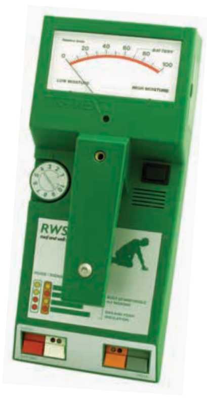
Product order code: RWS

The RWS incorporates two of the best known Tramex moisture scanners, the Leak Seeker for Roofing and the Wet Wall Detector for EIFS to give all the benefits and features of both of these time-proven instruments.