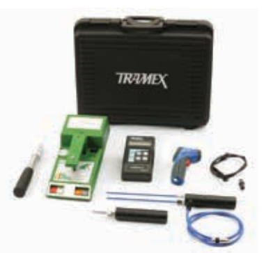
Product order code: RIK5.1

The RWS (a combination of the Leak Seeker and Wet Wall Detector) is available in the Exterior Insulation and Finishing Systems Inspection Kit for moisture detection and evaluation of walls and EIFS. This kit contains: the RWS (and aluminum telescopic handle for roof use), the MRH III for moisture condition readings in a variety of wall materials, a Hygro-i ® probe for ambient relative humidity readings, wood Pin-probes and hole-punch, and an infrared surface thermometer. Comes in a rugged foam-lined carry case.