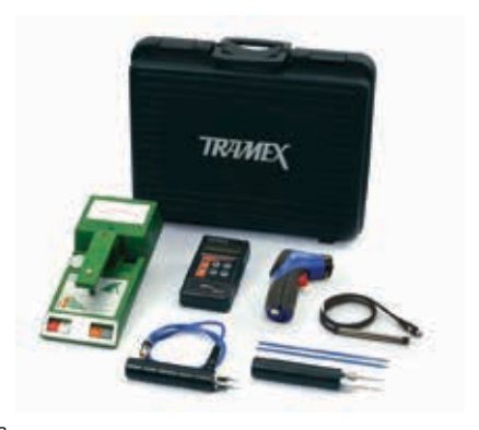
Product order code: EIK5.1