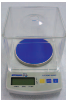
KK200 with breeze break